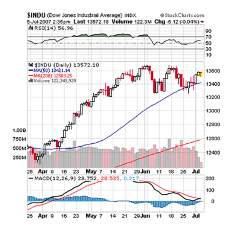
Ministry of Wealth earned a 371% gain on ICE in 16 months.

Now, you can get the "trading recommendations" of the Wall Street insiders delivered to your desk every week in my new advisory, Ministry of Wealth.