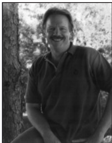
R.E. McMaster has advised and helped today's top investment advisors and traders. Now, you can trade the way this legend does with McMaster Online .

That way, you can make profits — like we did — of $1,150 in 11 days ... $3,950 in 15 days ... $1,080 in 21 days ... $1,590 in 24 days ... $2,800 in 29 days ... and $3,725 in 21 days — without spending hours reading charts or analyzing the markets. WE do all the "heavy lifting" for you — so you don't have to!