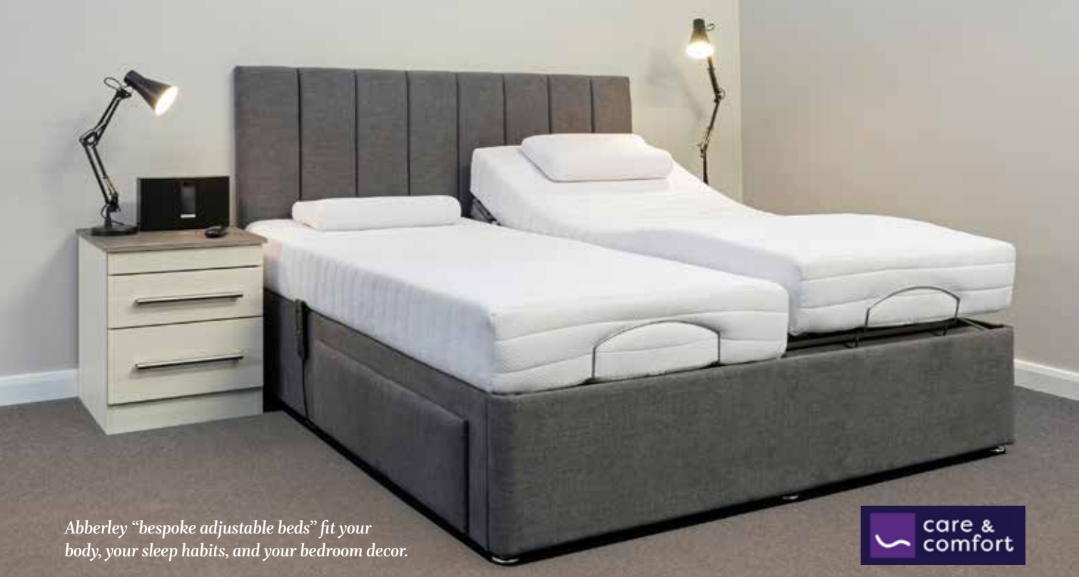
Abberley “bespoke adjustable beds” fit your body, your sleep habits, and your bedroom decor.