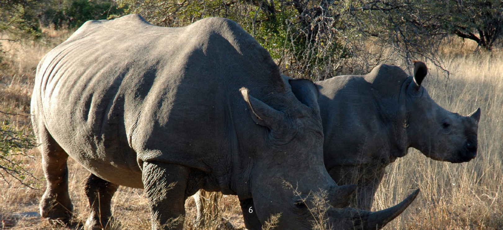
Both white rhino (pictured below) and black rhino are critically endangered species indigenous to Africa. There are only 3,500 black rhino left in the world.<sup>2</sup>

<sup>1</sup>http://wwf.panda.org/what_we_do/endangered_species/elephants/ <sup>2</sup>http://answersafrica.com/most-endangered-animals-in-africa.html