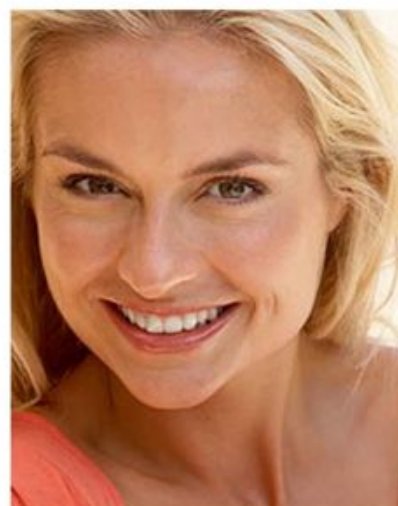
Smooth sun-damaged skin with Restore !

So what are you waiting for? To order Restore anti-wrinkle cream on a no-risk, 90-day trial basis, simply call toll-free 888-795-4005 today. Or click here now .