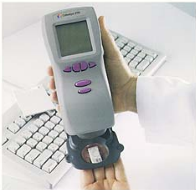
Optional dual apertures 4mm and 10mm in diameter enable convenient measurements of both large and small products.