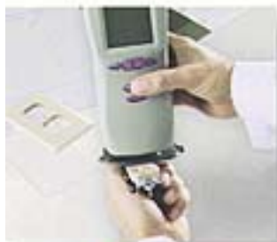
Removable targeting foot enables easy measurement of curved and flat samples.