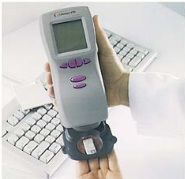
Optional dual apertures 4mm and 10mm in diameter enable convenient measurements of both large and small products.