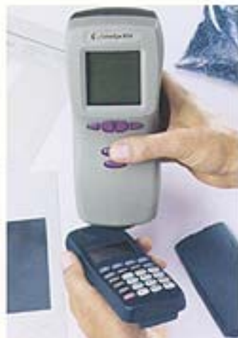
Contour measurement capability increases customer approvals on final product.