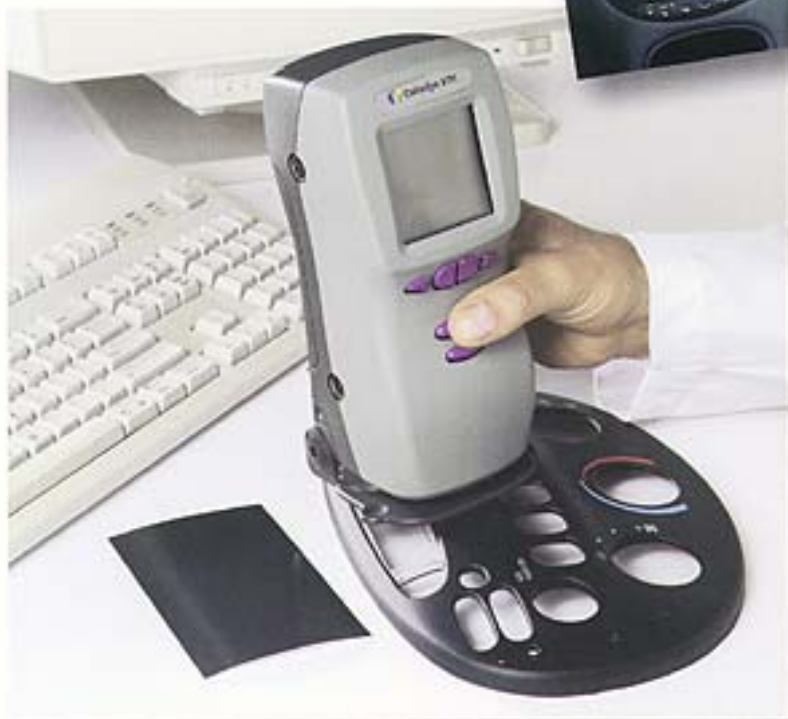
Dedicated buttons for standard and trial measurements speed and simplify operation.