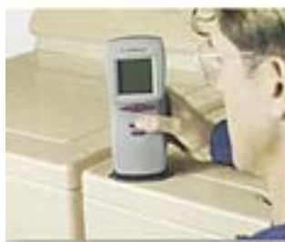
Lightweight ColorEye XTH weighs only 1.8 pounds and fits easily in the operator's left or right hand, eliminating strain.

About half the size and weight of other portables, the ColorEye XTH fits easily in your hand and clips conveniently to your belt. So you can carry it with you anywhere in your facility.