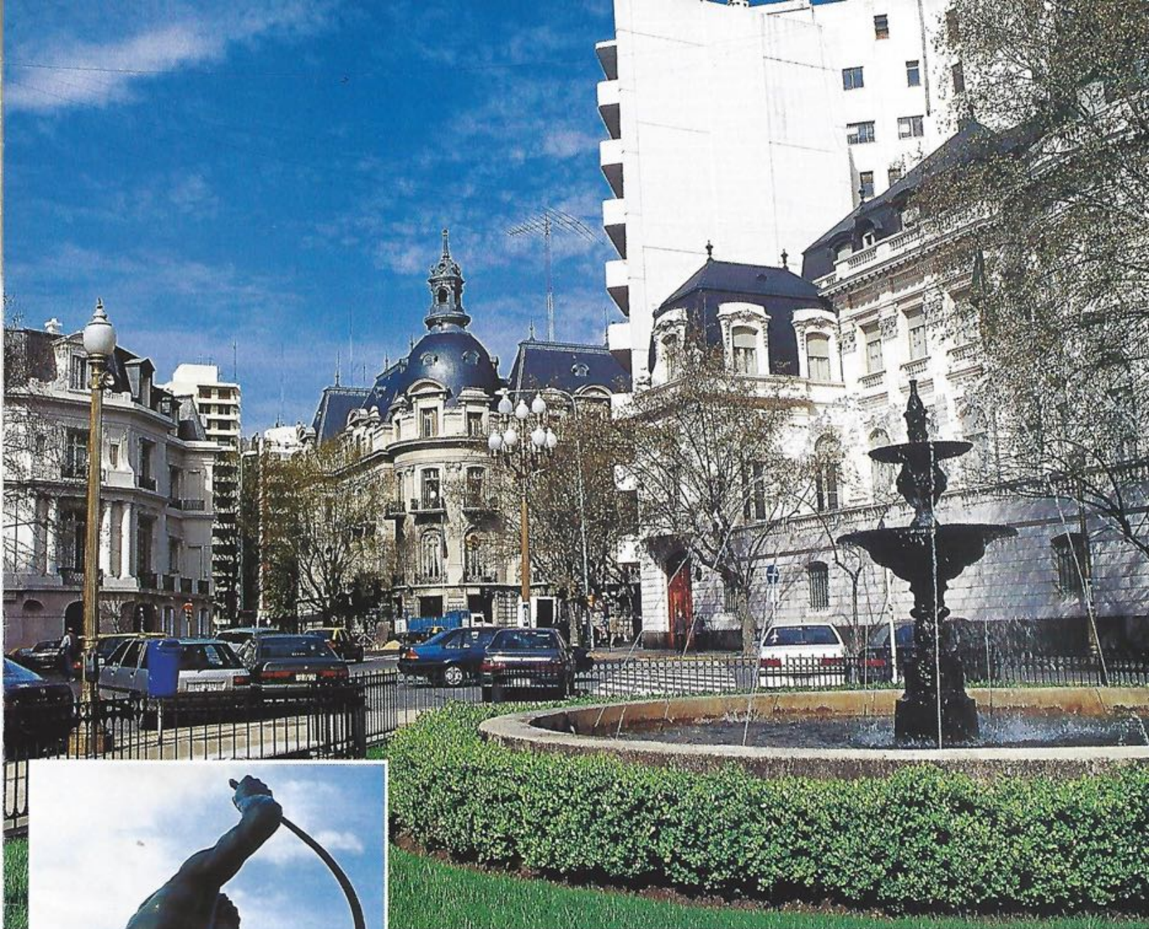
A view of Buenos Aires, the city where your bed is made.