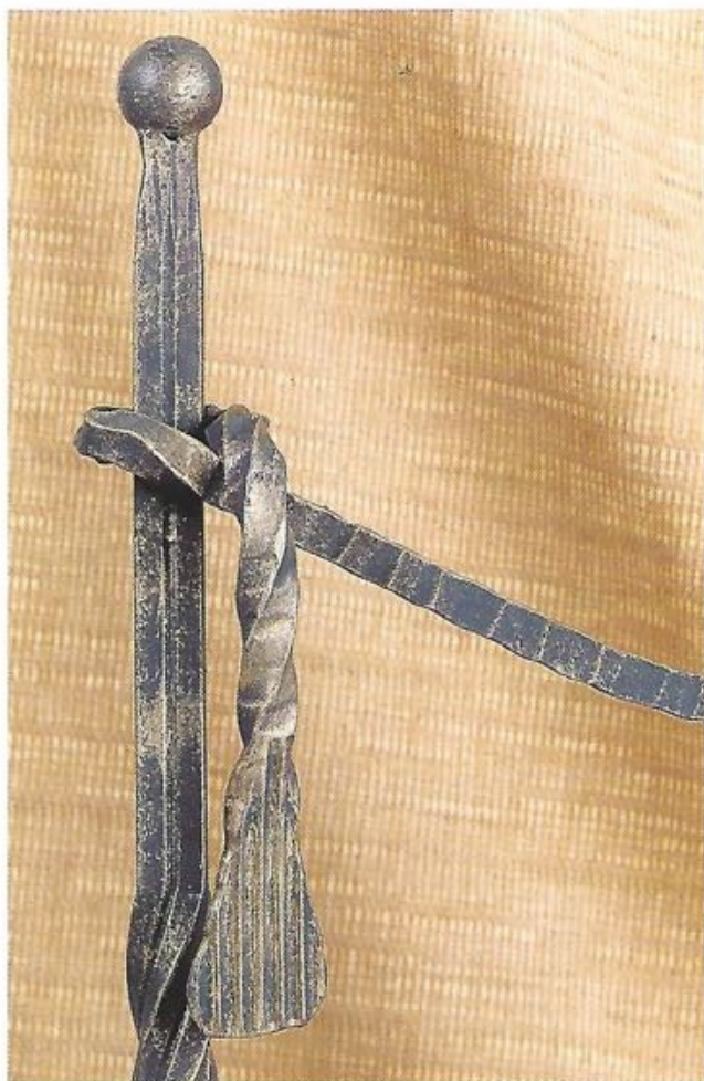
Close-up detail of the bed