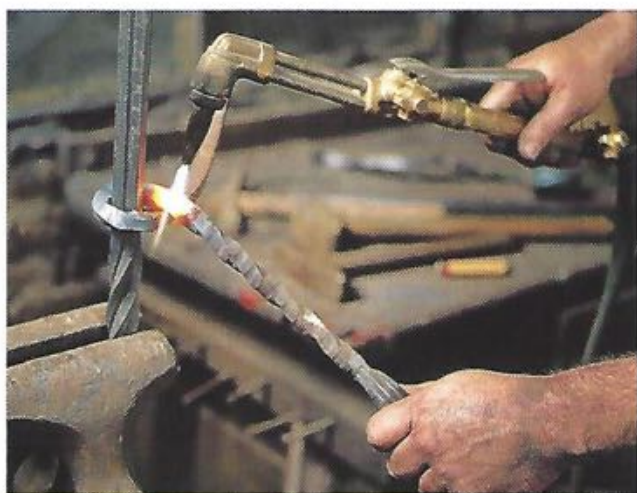
Craftsmen band forge each detailed piece of the bed.