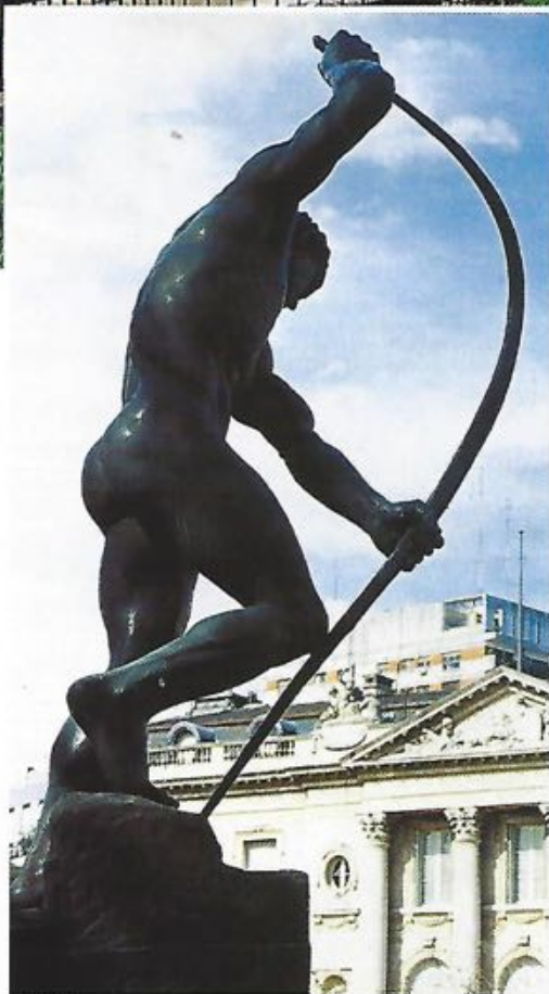
The National Museum of Fine Arts in Buenos Aires

visitors every year. The American furniture industry is based in and around this area.