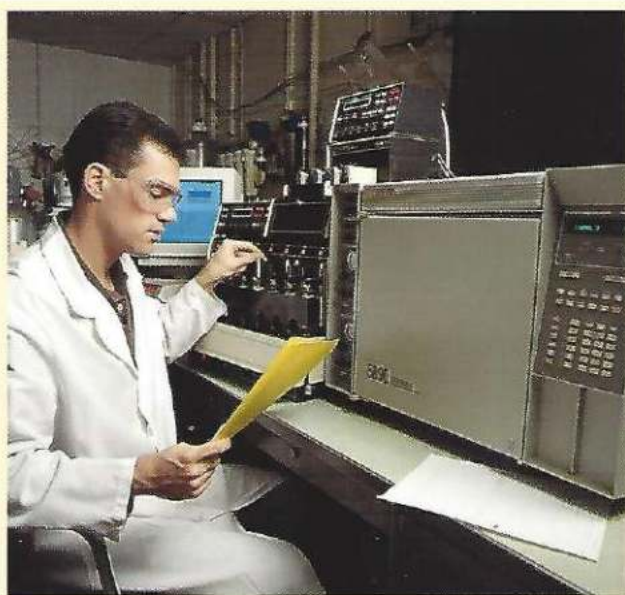
State-of-the-art analytical capabilities help us ensure the accuracy of each cylinder's contents.

With a product line consisting of more than 25,000 pure gases and custom blends, BOC Gases offers a single convenient source for all your process, environmental, and R&D needs — including