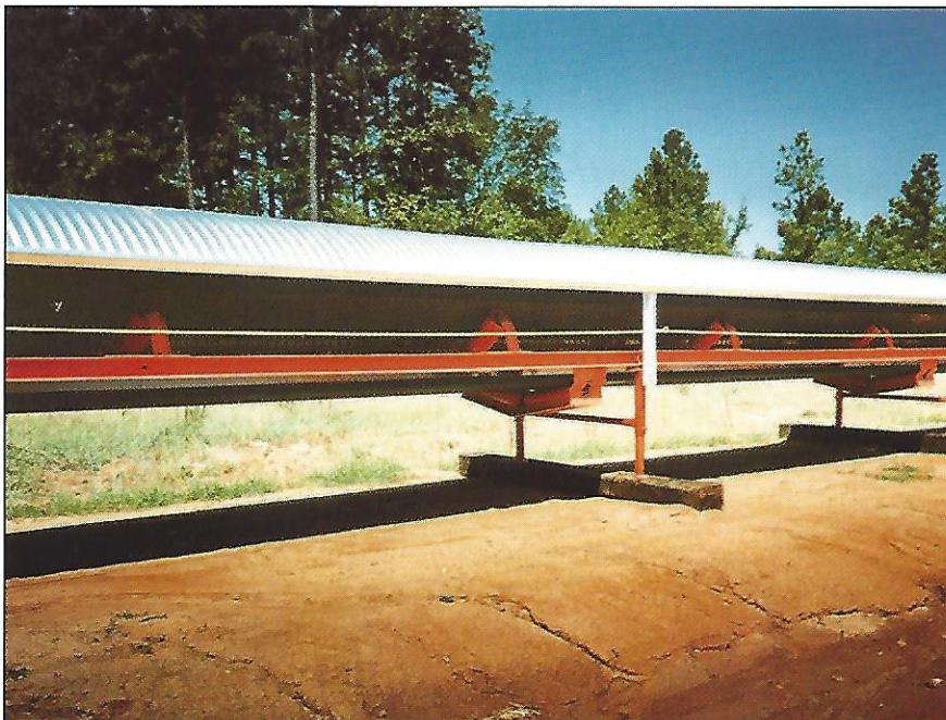
Belt capacity is 1,500 tons per hour at 800 feet per minute. Belt width is 36 inches.

For more information and a free conveyor catalog, call or write Continental Conveyor today.