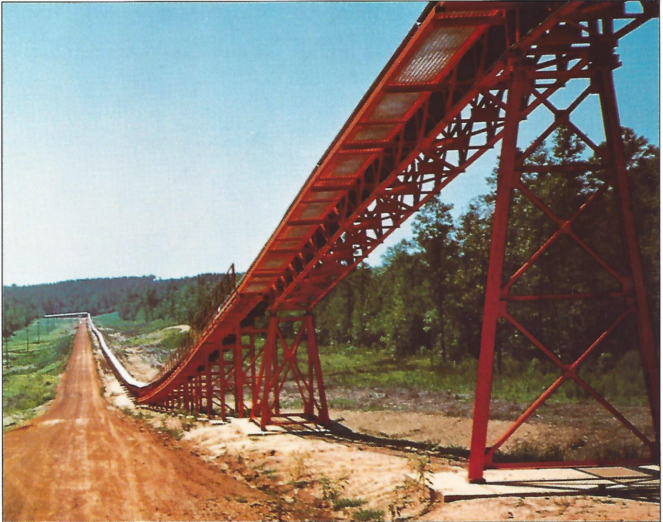
A 7-mile-long overland Continental conveyor carries 14,000 to 15,000 tons of lignite daily.