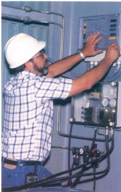
Lubrication at all bearings is controlled through a single panel.

By providing continuous and precise lubrication to bearing cavities, Safegrease ensures reliable machine performance and significantly reduces bearing failure.